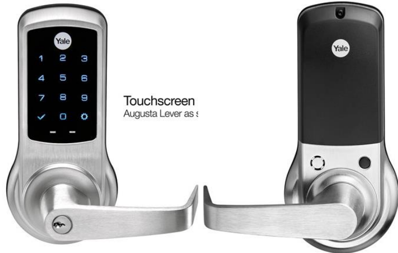
Touchscreen Augusta Lever as s

Functions are UL - cUL Fire Listed for use on fire doors having a rating up to and including 3-hours